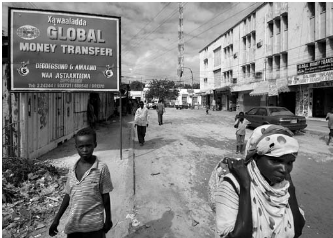
5. Billboard advertising an international money transfer company in Mogadishu, Somalia

These data problems notwithstanding, the World Bank produces annual estimates of the scale of remittances worldwide. They estimate that in 2004 some US$150 billion was sent home by migrants, and forecasts indicate that the figure was closer to US$200 billion in 2005. These are quite staggering sums. They are also striking because they represent a 50 per cent increase in the flow of remittances in just five years – the main reason being the impact of globalization. According to some analysts, in terms of